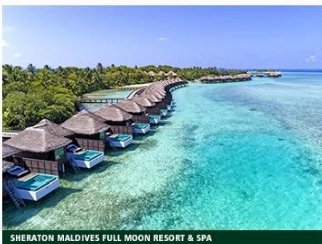
SHERATON MALDIVES FULL MOON RESORT & SPA