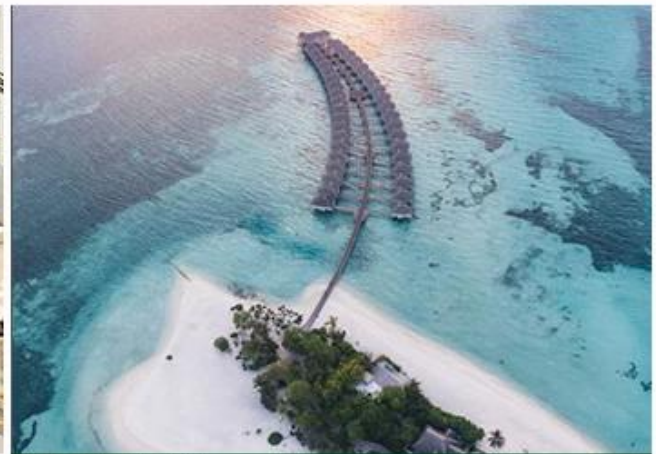
LUX SOUTH ARI ATOLL