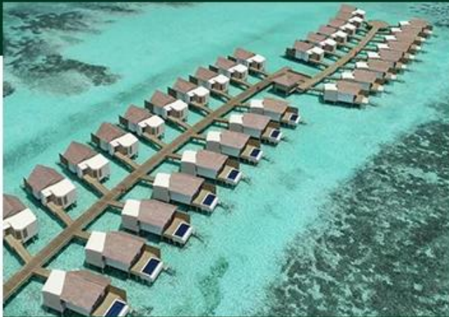
HARDROCK HOTEL MALDIVES