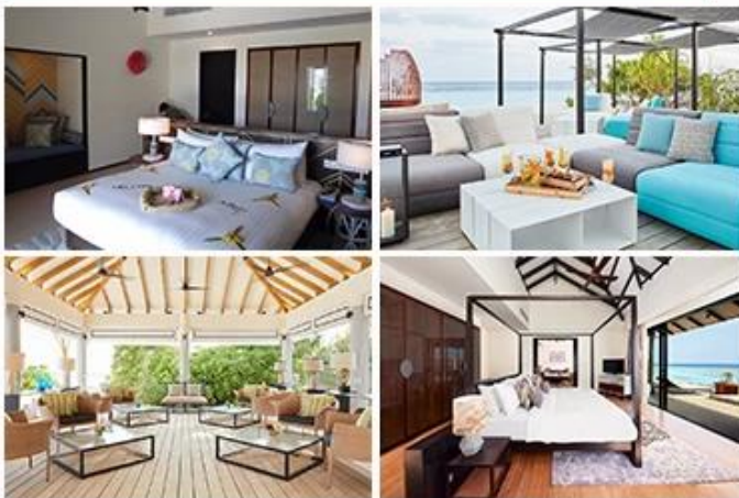
AMARI HAVODDA MALDIVES