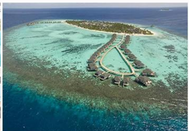
AMARI HAVODDA MALDIVES