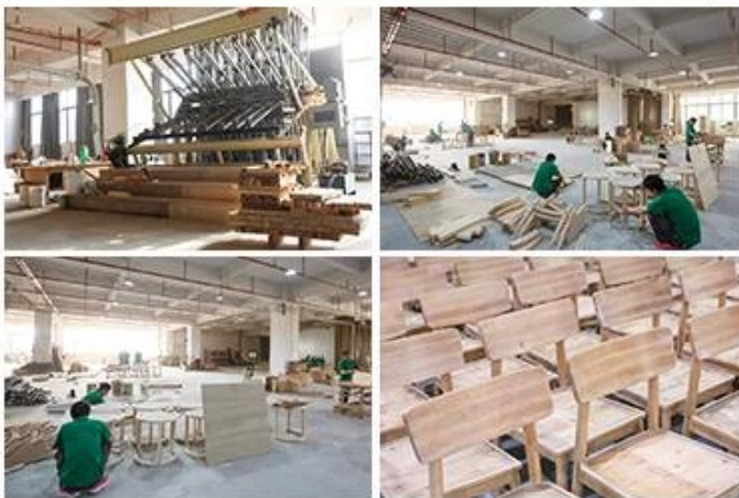
SOLID WOOD WORKSHOP