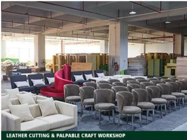
LEATHER CUTTING & PALPABLE CRAFT WORKSHOP