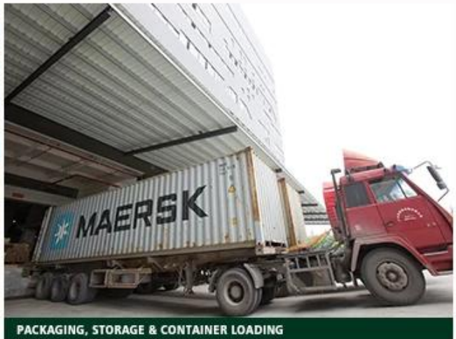
PACKAGING, STORAGE & CONTAINER LOADING