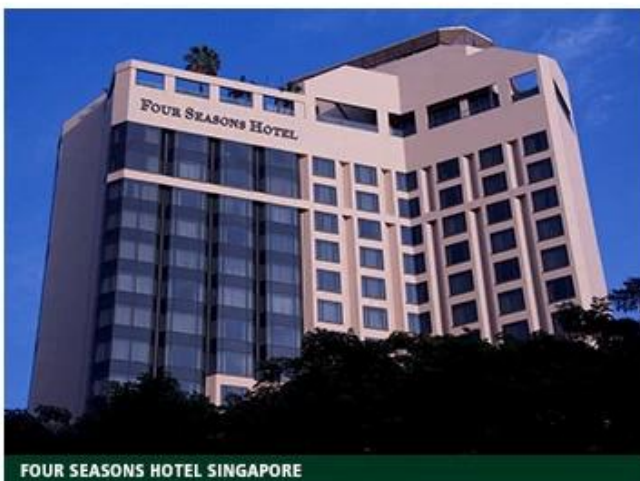
FOUR SEASONS HOTEL SINGAPORE