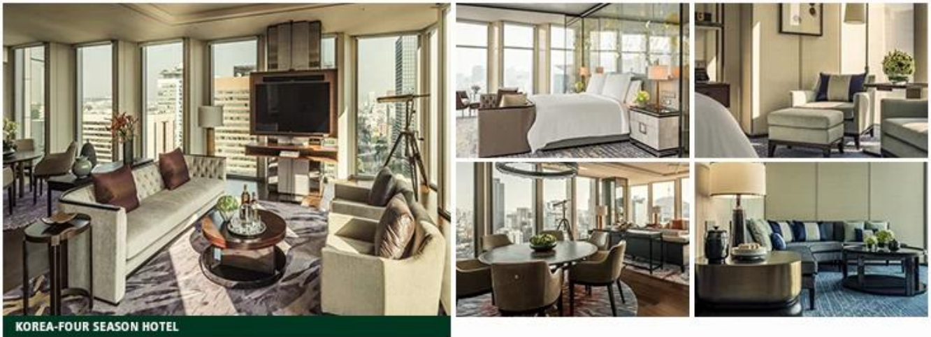
KOREA-FOUR SEASON HOTEL