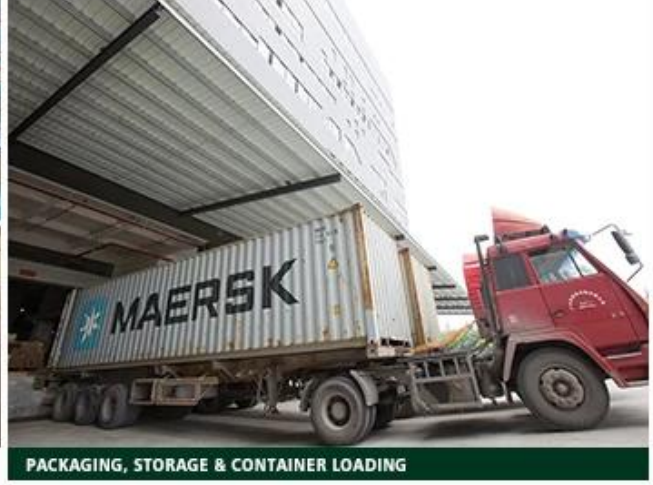
PACKAGING, STORAGE & CONTAINER LOADING