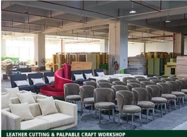
LEATHER CUTTING & PALPABLE CRAFT WORKSHOP