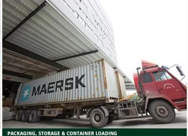
PACKAGING, STORAGE & CONTAINER LOADING