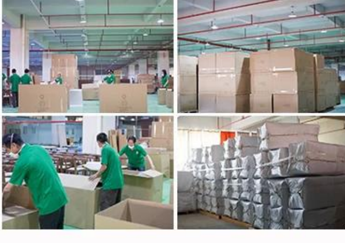
PACKAGING, STORAGE & CONTAINER LOADING