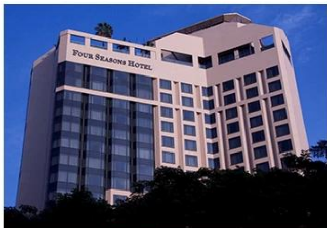
FOUR SEASONS HOTEL SINGAPORE