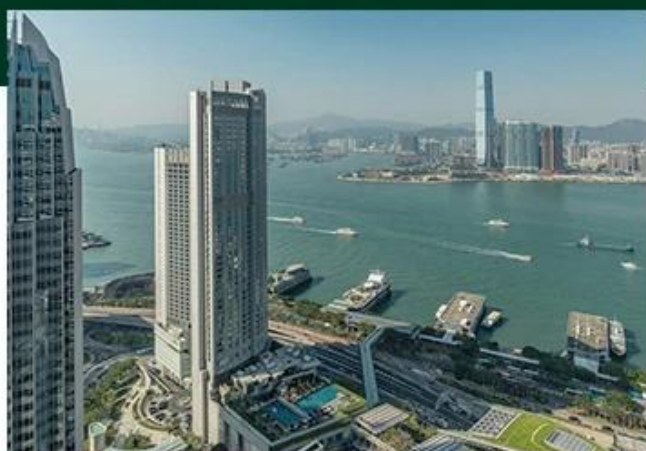
FOUR SEASONS HONG KONG