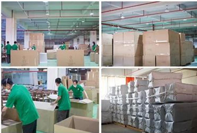
PACKAGING, STORAGE & CONTAINER LOADING