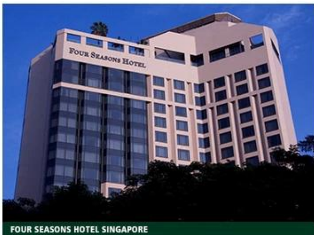
FOUR SEASONS HOTEL SINGAPORE