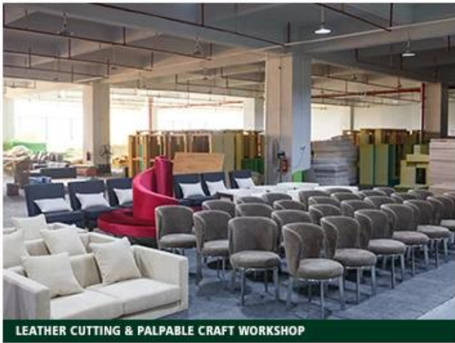
LEATHER CUTTING & PALPABLE CRAFT WORKSHOP