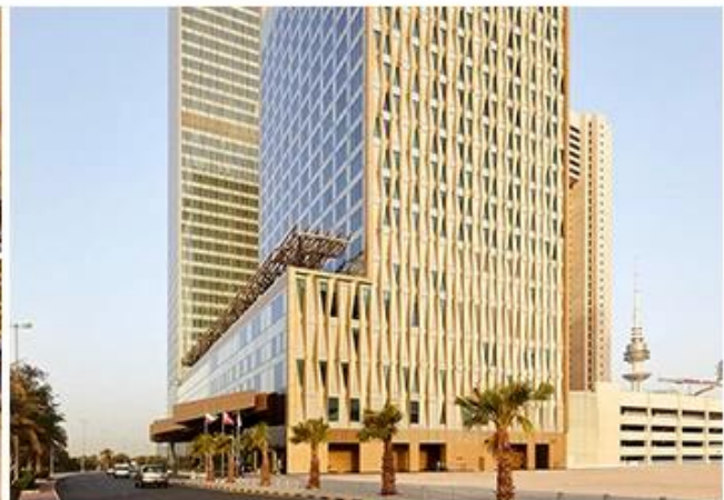
FOUR SEASONS HOTEL KUWAIT AT BURJ ALSHAYA