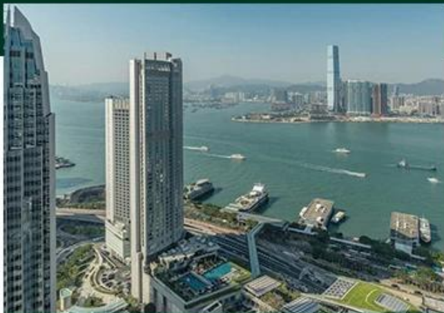
FOUR SEASONS HONG KONG