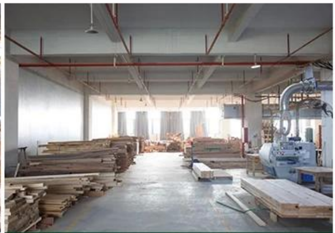
SOLID WOOD WORKSHOP