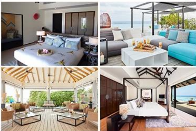
AMARI HAVODDA MALDIVES