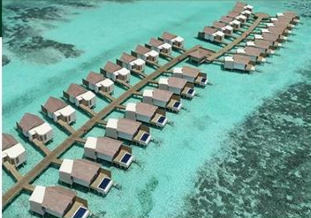
HARDROCK HOTEL MALDIVES