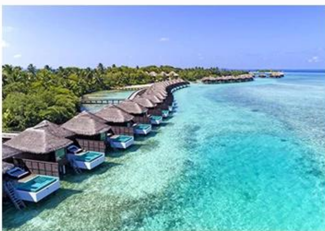
SHERATON MALDIVES FULL MOON RESORT & SPA