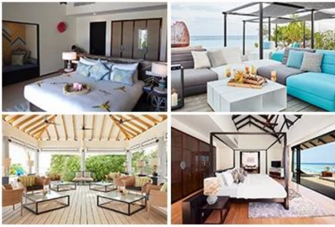
AMARI HAVODDA MALDIVES