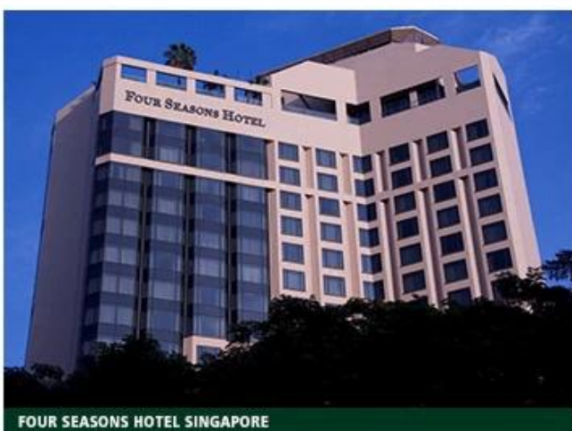
FOUR SEASONS HOTEL SINGAPORE