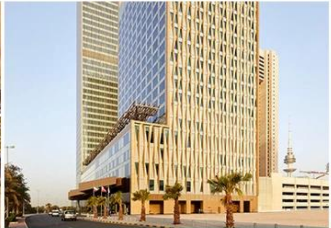
FOUR SEASONS HOTEL KUWAIT AT BURJ ALSHAYA