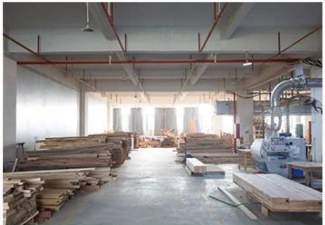
SOLID WOOD WORKSHOP