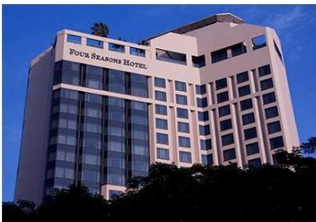
FOUR SEASONS HOTEL SINGAPORE