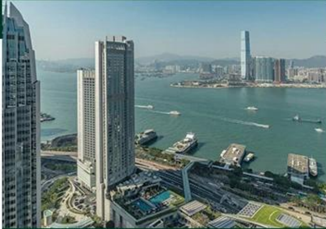
FOUR SEASONS HONG KONG