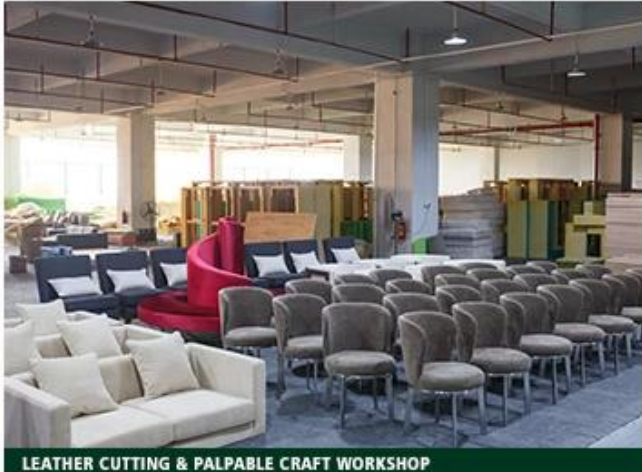
LEATHER CUTTING & PALPABLE CRAFT WORKSHOP