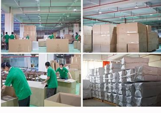
PACKAGING, STORAGE & CONTAINER LOADING