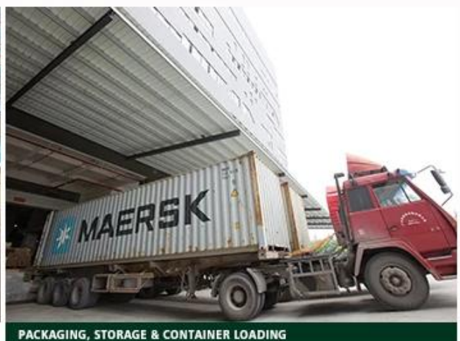
PACKAGING, STORAGE & CONTAINER LOADING