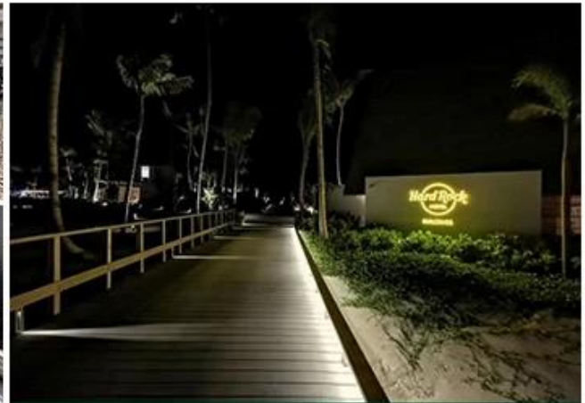
HARDROCK HOTEL RESTAURANT MALDIVES