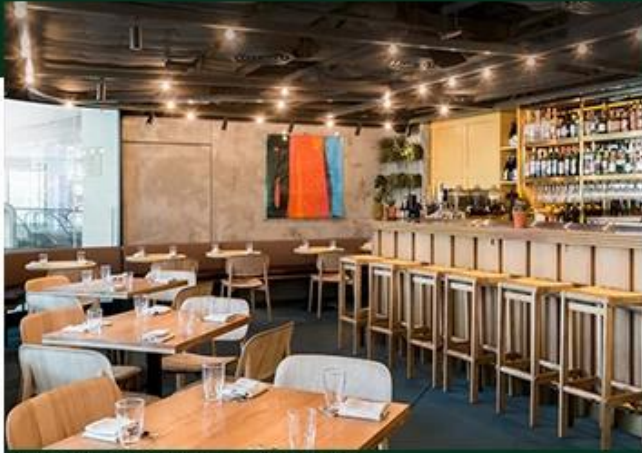
COMMISSARY RESTAURANT, HONG KONG