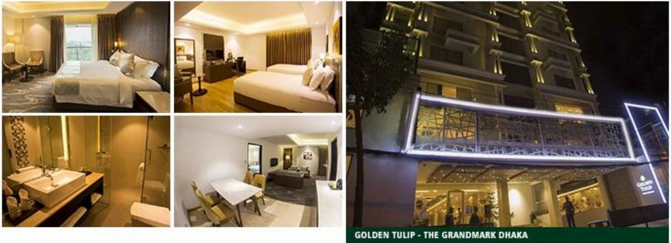
GOLDEN TULIP - THE GRANDMARK DHAKA